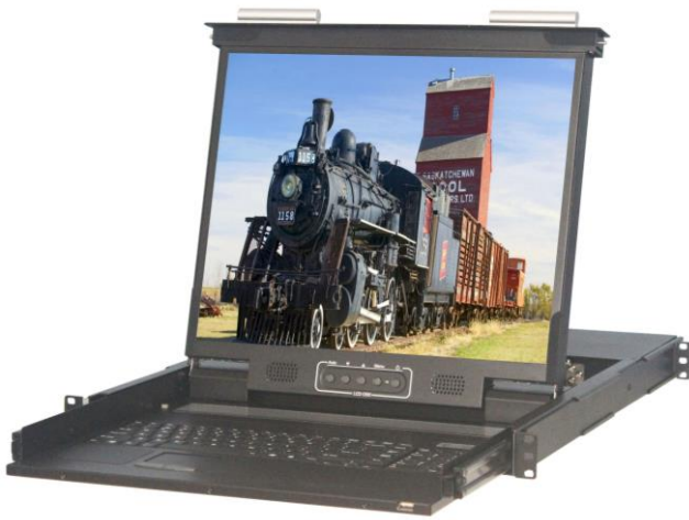
↑ (USB Port for device access)

Optimize rack space. Maximize rack monitoring DVI-D-USB & VGA-USB, Audio, Hub